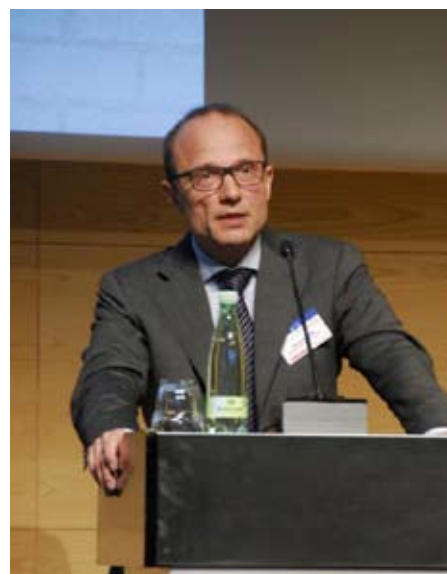
Morten Kjaerum, Director of the FRA, Photo: FRA, 2012