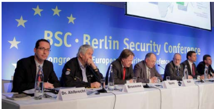
Panel “Protection of Crisis Management Forces”

For more information, please visit european-defence.com