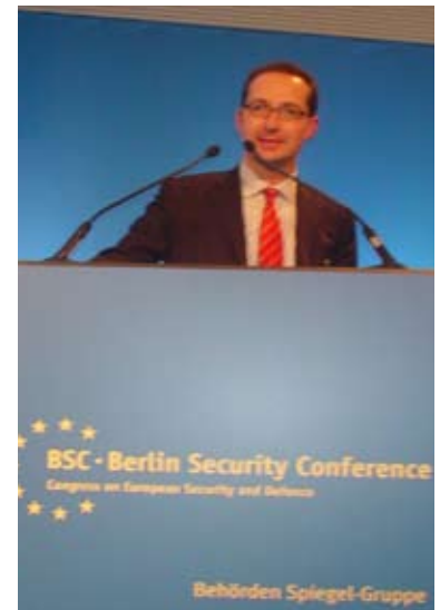
EUROMIL Secretary General