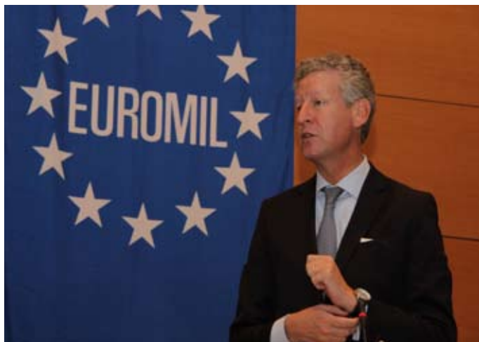
Pieter De Crem, Belgian Minister of Defence, Photo: EUROMIL

integrated with partners in Europe, and finally acknowledged the role of EUROMIL in this process of strengthening cooperation between European armed forces to defend the social and professional interests of military personnel.