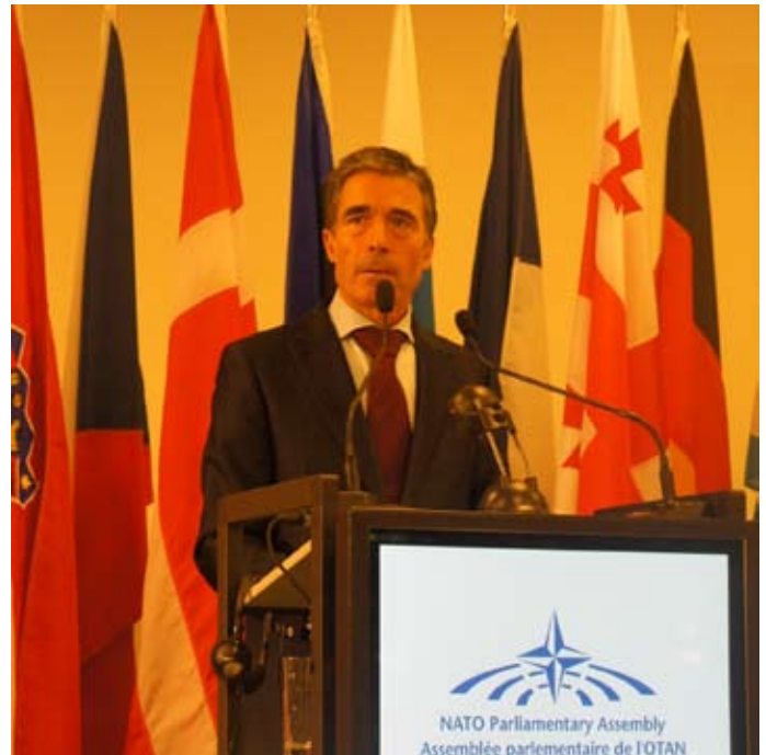
NATO Secretary General, Anders Fogh Rasmussen