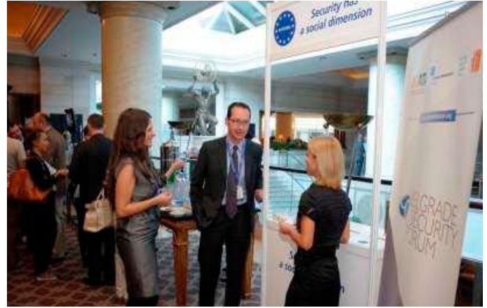
EUROMIL booth “Security has a social dimension”

For more information, please visit www.belgradeforum.org GA