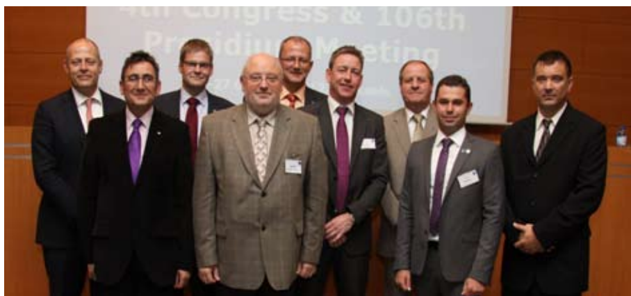
EUROMIL newly elected Board