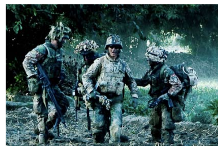
Scene from ARMADILLO