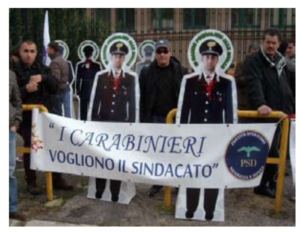
These comrades could wear uniforms.

with a dagger drove in the back to symbolise the feeling of betrayal by the government, who promised reforms, especially on the right of association, but instead cut salaries.