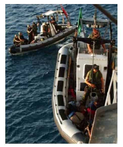
Boarding team with captured suspects