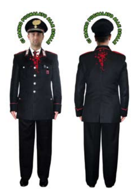
"We were stabbed in the back"

But the principle of command and obedience should not be abused to demean the dignity of the citizen in uniform. The Italian Constitution guarantees all citizens to have equal social dignity and to be equal before the law (Art. 3), the right to assemble peacefully (Art. 17), the right to form associations freely and without authorisation (Art. 18), and trade unions may be freely established (Art. 39). While some restrictions are indeed acceptable to ensure the accomplishment of certain