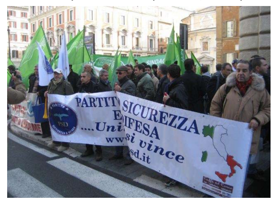
Demonstration under the flag of PSD for fundamental rights and better conditions.

The demonstrating employees from military and police held cardboards in the shape of carabinieri, soldiers and policemen