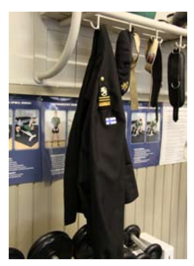
ASLAK causes no financial loss for union members.

while their numbers get fewer. In international duties, it is usually possible to match troop strength to their task. Their resources lie in numbers, while heavy external pressure taxes them mentally. Every day, they must worry about their own safety and that of their comrades.