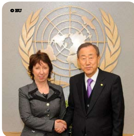
HR/VP Ashton, UN Secretary-General Ban Ki-Moon

the Council and the Commission. The same is true for the EEAS as it combines departments from the Commission and the Council, with CSDP de facto 'partitioned' from the rest of the EEAS bodies. The HR/VP depends very much on the cooperation of the Council, and, therefore, CSDP depends on the manner in which the HR/VP will be willing and able to organise the relevant services and to establish herself. So far, this has proven rather difficult: merging the three functions made the HR/VP preside over a bureaucratic mess. Disputes over budgets and rules as well as over jobs have delayed the launch of the