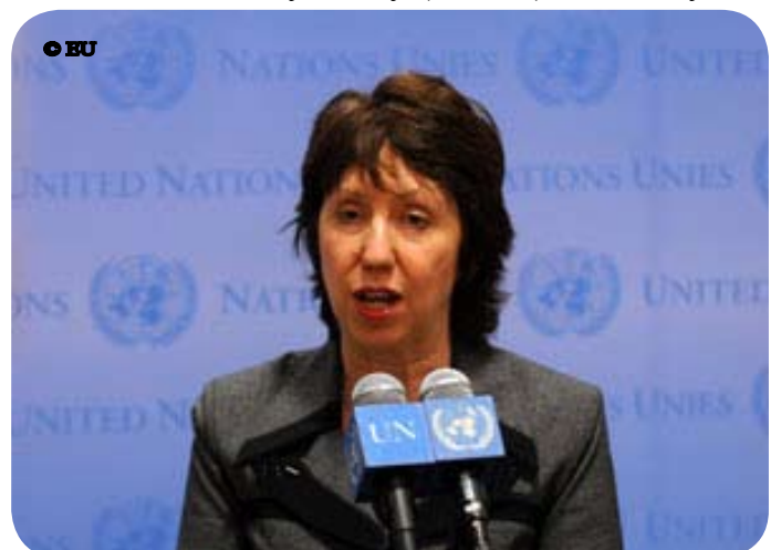
Baroness Catherine Ashton, HR/VP

Much discussed new provisions of the Lisbon Treaty are the post of High Representative for Foreign Affairs and Security Policy (HR/VP) – not only due