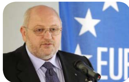
Emmanuel Jacob, EUROMIL President

halts funding of high tech equipment such as the Talarion unmanned aerial vehicle, cuts the number of NH90 transport helicopters and Tiger combat helicopters, etc. The Netherlands stopped maritime reconnaissance, Denmark discontinues submarines, the Baltic states have no air force worth mentioning. One should think that increasing the efficiency of defence budgets in the current economic crisis