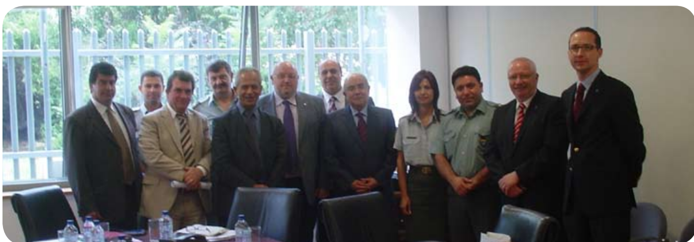
CAOA, N-COACA, CAROA and EUROMIL delegates

Another big problem in the Cypriot National Guard consists in a kind of moratorium on promotion. It affects almost all soldiers and – according to General Tsalikides – has an adverse effect on the operational capabilities of the armed forces. Since 2006 everything is blocked. Part of a solution will be hopefully found by the end of 2010, when 400 will have been promoted – as the MoD promised but there should be a systematic long-term approach. The issue