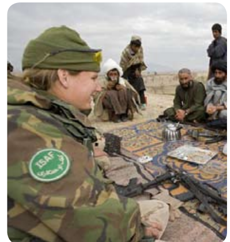
Women in ISAF

a history that extends over 4000 years into the past, throughout a vast number of cultures and nations. From ancient warriors to women currently serving in military operations, women have played many roles in the military.